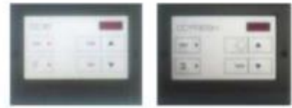
CONTROLLER - DIGITAL