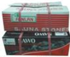
Sauna Stone 20kg box