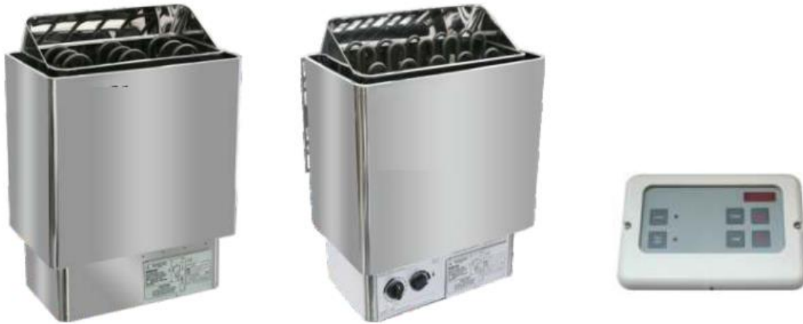
WAV – 6 SERIES