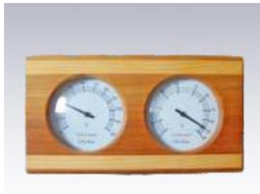
Thermometer and Hygrometer