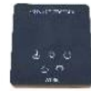
WAV – 5 SERIES