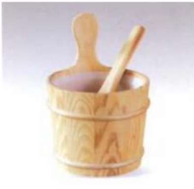
Bucket and Ladle